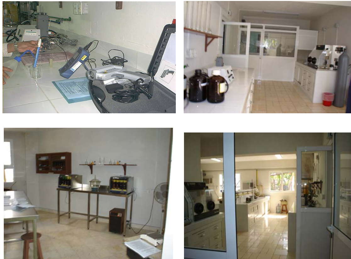
Fig. 1. Areas of laboratories in the CENGMA, ICIDCA

With invaluable support of UNIDO in the many activities promoted in the interests of development and sustainability of this national network, the ICIDCA has consolidated the work of the National Reference Center for Environmental Management of the Sugar Industry and Derivatives (CENGMA) (inaugurated in 2006), whose main objective is to achieve full integration and comprehensive concept of CP in policies and practices in the sugar industry, and allow sugar factories integrate all the sugar and derivatives in this objective.