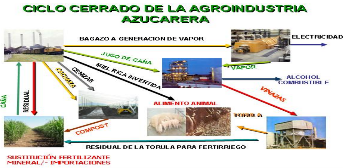
Figura 1. Closed cycle in the sugar industry.