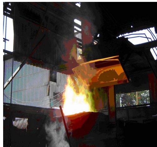
Cubana de Bronze, located in the Havana